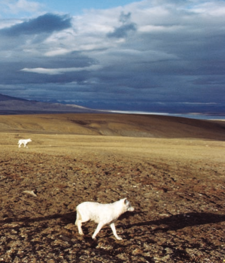
The wolves of Ellesmere Island have never been hunted

Mech. Packs are shaped by environment and chance: the established order can be shattered by a shortage of food or the death of a parent. In times of change, it is common for the classic pack structure to be disrupted. Monogamous packs are the norm only in areas where prey is abundant and humans do not hunt wolves. In other situations, all kinds of new family conformations have been